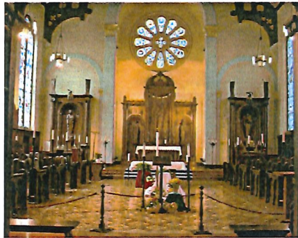
Mount Carmel Chapel